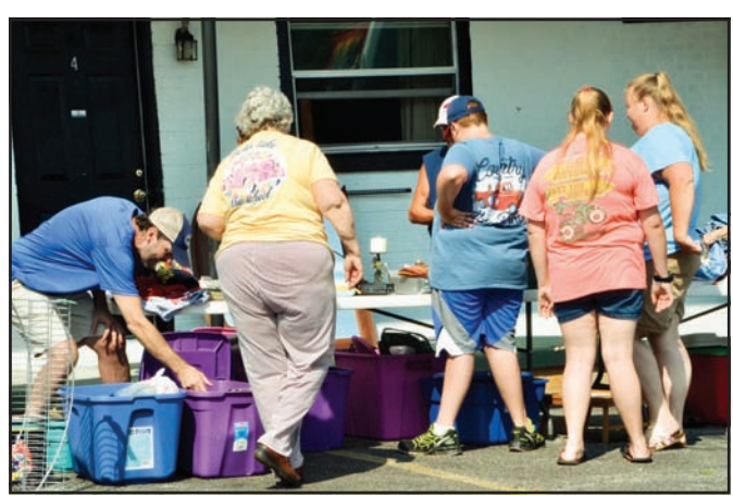
Residents attended a yard sale out front of Mull's Inn in Hiawassee Saturday.

"It is time for people to get back to work and get this