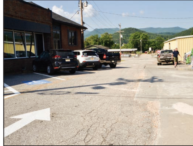
The new one-way between Trailful at the old Victoria's Attic building and Hiawassee Hardware has created new parking places and improved the streetscape for everyone.