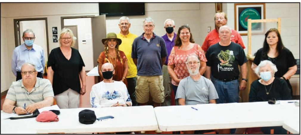
The Georgia Mountain Fair Board of Directors met July 16 to postpone the 2020 fair due to COVID-19.