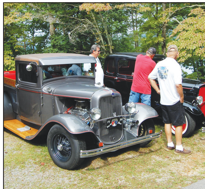
The Georgia Mountain Moonshine Cruiz-In returns next weekend for its 12th year. Pictured here: the 2013 Moonshine Cruiz-In.